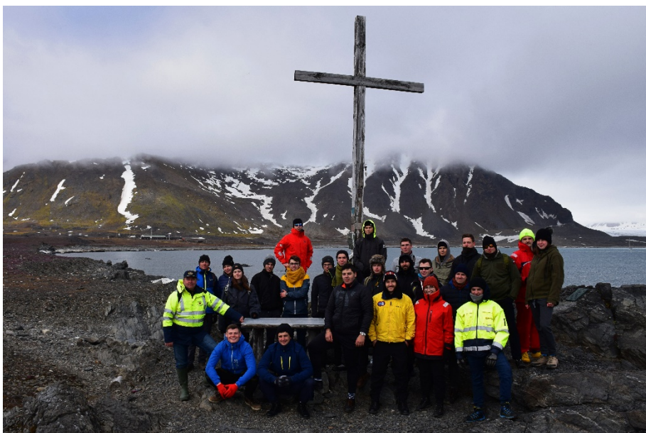
Fig. 8. Students of Gdynia Maritime University in Hornsund Fjord in June 2020

The students are mostly interested in diving to wrecks located in Hornsund Fjord to establish their precise position and to prepare accurate photographic documentation.