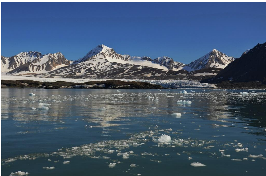
Fig. 3. Floating ice after calving of Hansbreen