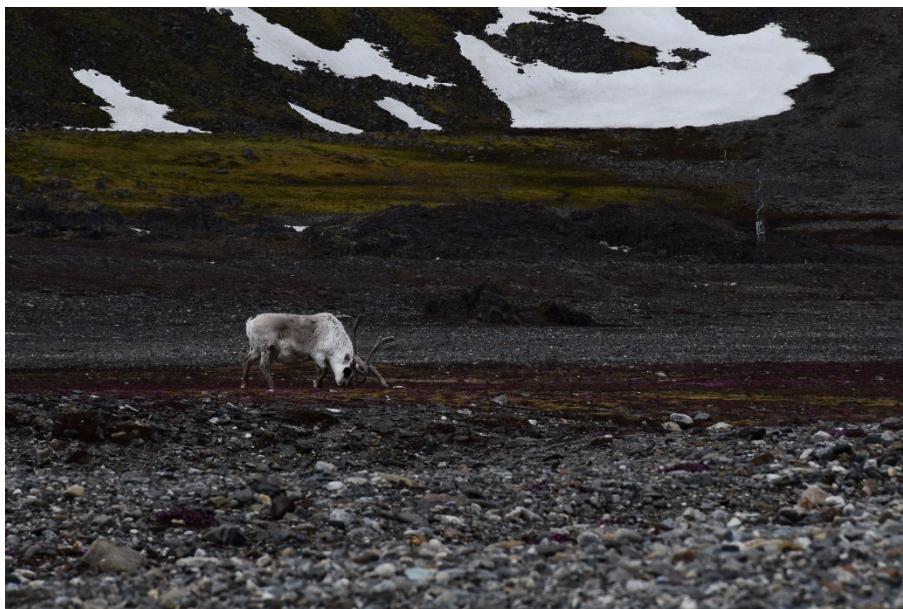
Fig. 5. Reindeer near Hornsund Station