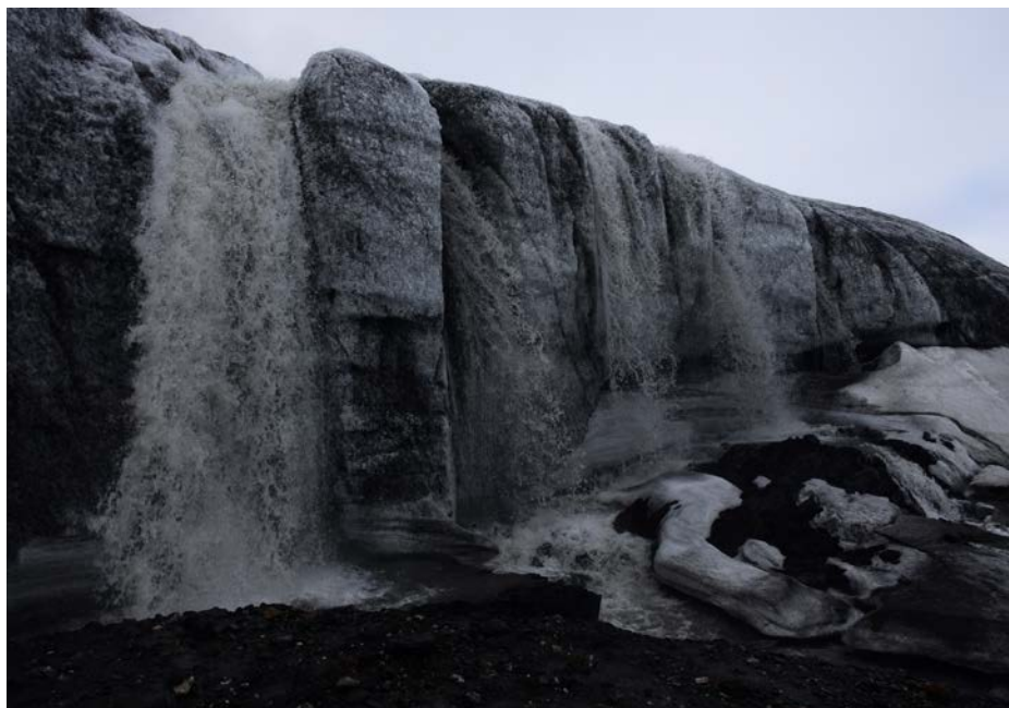
Fig. 7. Waterfall at the Hansbreen Ice Cliff

The glacier valley is limited by the Sofiekammen ridge to the east, the highest elevation of which is Wienertinden at 924 m a.s.l., and a mountain chain on the western side, with the highest point being the northern peak of Slyngfjellet (788 m a.s.l.). There are two passes connecting Hansbreen with Werenskioldbreen to the west – Kosibapasset and Bergkardet. Their elevation is below 500 m. a.s.l. The eastern mountain ridge has a mean altitude of c. 700 m a.s.l. and a relative elevation of approx. 500 m above the glacier's surface, excluding lower elevation passes. It forms an orographic barrier to air masses advecting from the east. Therefore, a distinct foehn effect can be observed during easterly winds. The mountain range bounding Hansbreen on the western side is generally 150–200 m lower than that on the eastern side (especially in the southern part), and it is dissected by tributary valleys [Budzik et al. 2012].