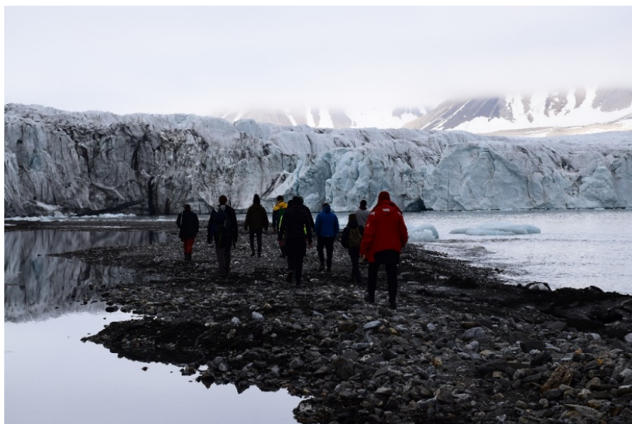
Fig. 6. Hansbreen Ice Cliff

Hansbreen is located in southern Spitsbergen (Svalbard) and flows from mountains to the north and terminates in Isbjørnahamna Bay to the south. It is a medium-sized glacier, the estimated surface area of which is circa 56 km 2 with a 4 km-wide tongue and a 1.5 km-wide active calving front. The ice divide to the north between Hansbreen and Vrangpeisbreen is well-defined and is located at about 490 m a.s.l. [Budzik et al. 2012]. The eastern boundary between Hansbreen and its neighbouring glacier Paierlbreen is more difficult to define due to the transfusion of ice from the accumulation field to Kvitungisen (a tributary of Paierlbreen) through a glacial breach. Due to the surge of Paierlbreen in the 1990s, the glacier surface topography in the area was altered. Thus, the location of the ice divide has changed over time, and different surface areas have been reported for Hansbreen in different publications [Budzik et al. 2012].