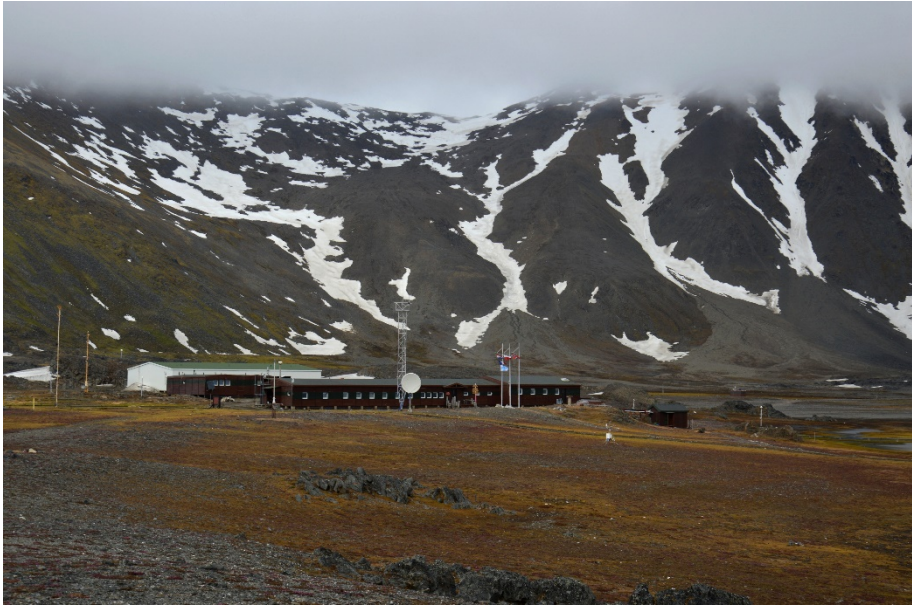
Fig. 1. Polish Polar Station in Hornsund (1)